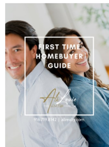
First Time Homebuyer Guide